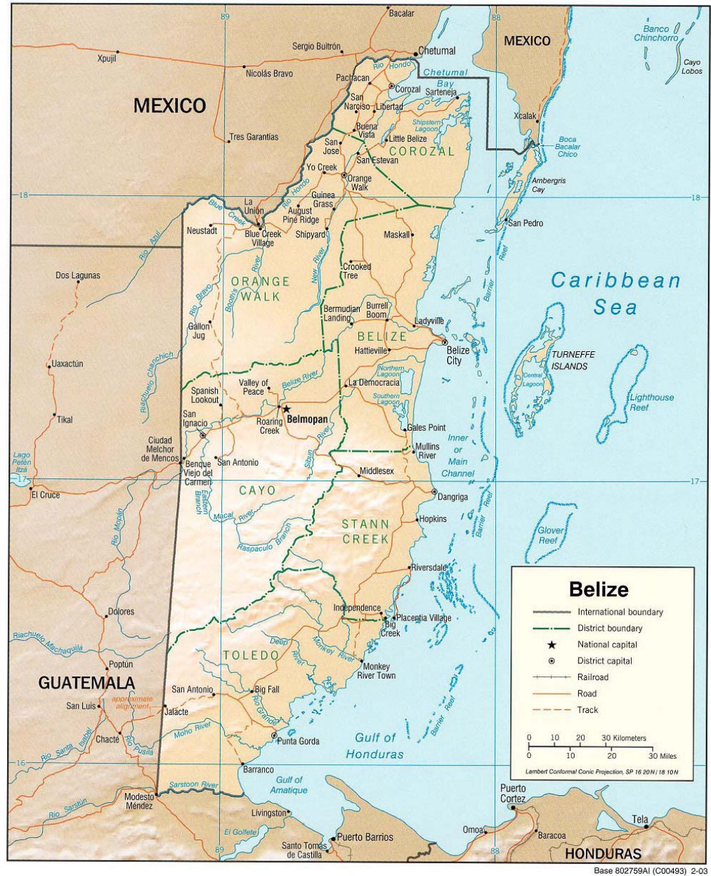
Figure 2: Map of Belize