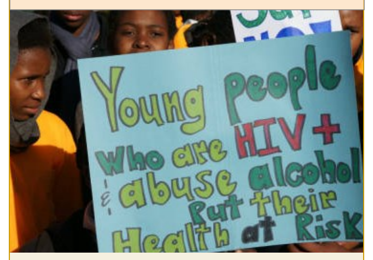
Overall, communities strengthened their capacity to mitigate the effects of HIV/AIDS. Individuals improved their ability to make healthy decisions related to HIV/AIDS and participants' opinions about Americans became more positive.