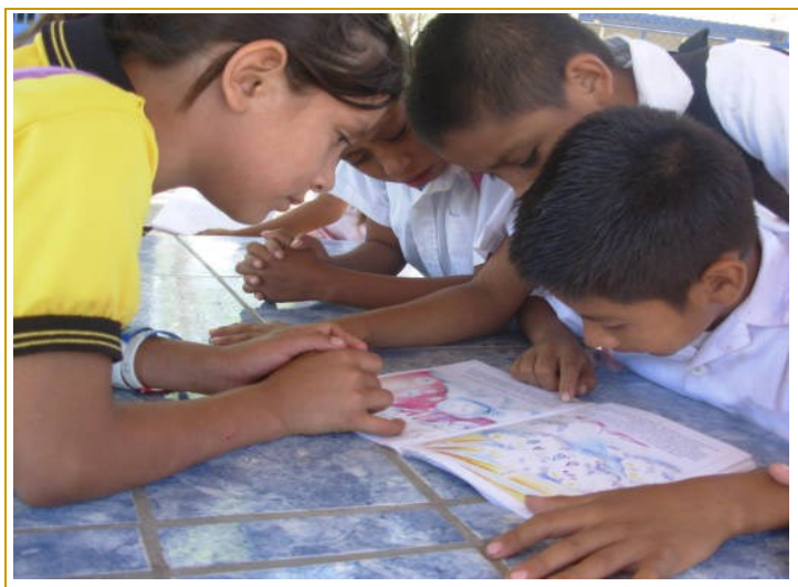
Peace Corps Goal Two "To help promote a better understanding of Americans on the part of the people served."