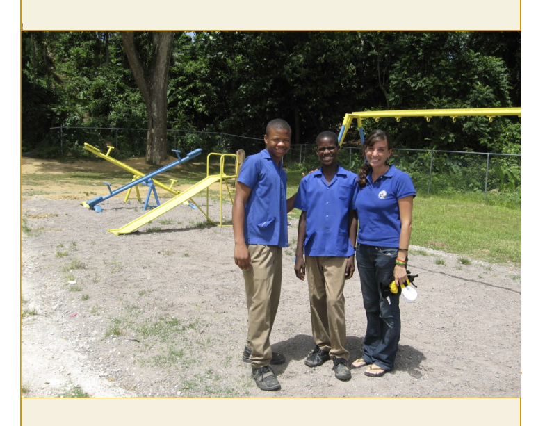
Project partners and beneficiaries Host family members

Overall, communities improved their quality of life through better sanitation and health services. Participants continue to use the skills they learned from the Volunteer in their daily lives, leading to sustained change.