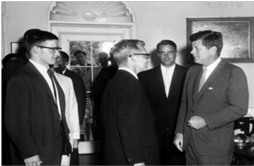
President John F. Kennedy and Peace Corps Director Sargent Shriver greet departing Tanganyika and Ghana Peace Corps Volunteers in the Oval Office.