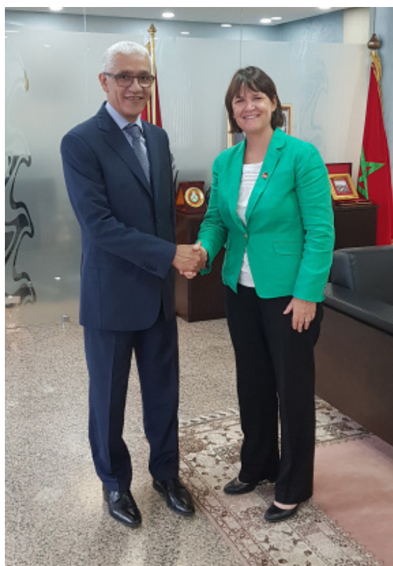
Country Director Susan M. Dwyer with Minister of Youth and Sports Rachid Talbi Alami

The Ministry of Interior and the Gendarmerie Royale actively assist the Peace Corps in keeping Volunteers safe and offer emergency support at both national and local levels. Peace Corps Morocco is grateful for the guidance, collegiality and encouragement from our partners and friends in the Government of Morocco.