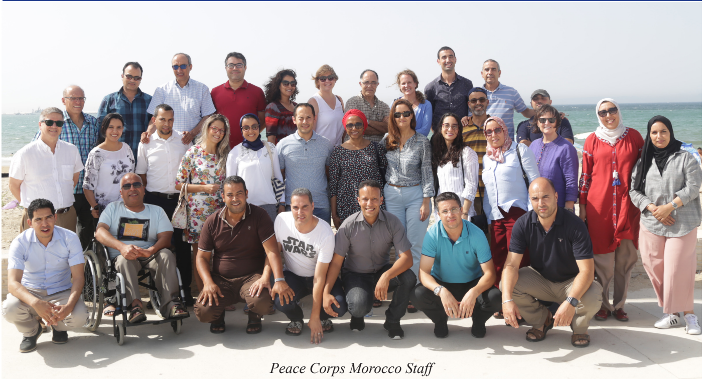
Peace Corps Morocco Staff