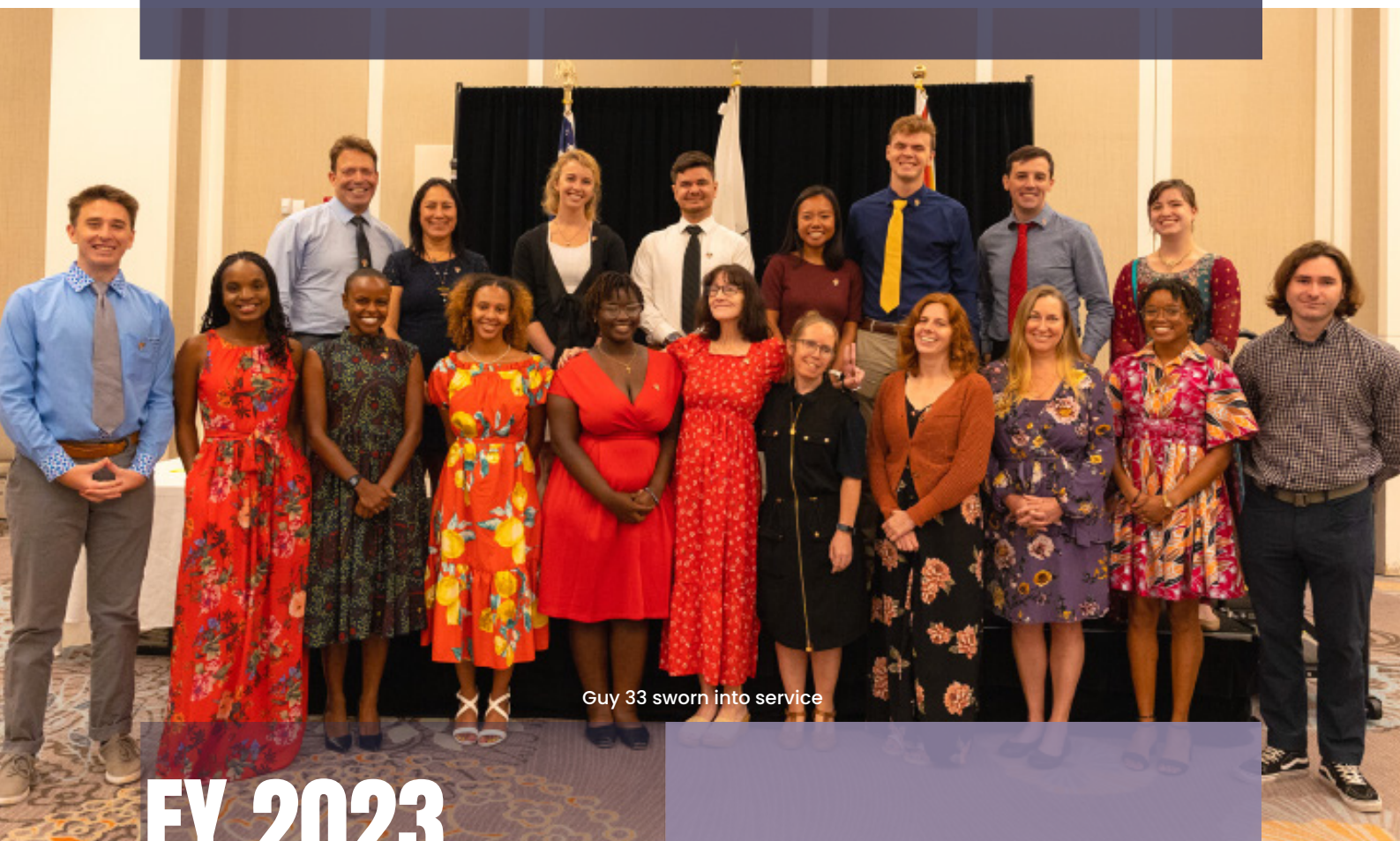
Guy 33 sworn into service