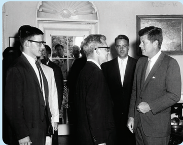
President John F. Kennedy and Peace Corps Director Sargent Shriver greet departing Tanganyika and Ghana Peace Corps Volunteers in the Oval Office.