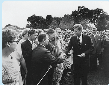
President John F. Kennedy greets volunteers on August 28, 1961.