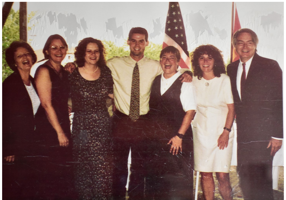
Group: MAK 1, 1996

Peace Corps Volunteers serve in one of two projects English and Inclusive Education and Community Development, with a special focus on youth and special needs.