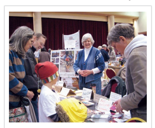
RPCVs of Wisconsin-Madison teach others about the Peace Corps during a recent event.

FSL has funded a women's agricultural project and provided support for training nurses at a pediatric hospital in the past two years. Two primary schools, a technical school, and a community resources center in Sierra Leone also benefited from FSL's help.