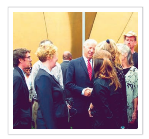
Vice President Joe Biden greets Volunteers during a visit to the U.S. Embassy in Kenya on June 10.

Ranging in age from 23 to 65, the following Volunteers attended the