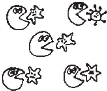
T8 — CD8 Cytotoxic (Killer) Cells