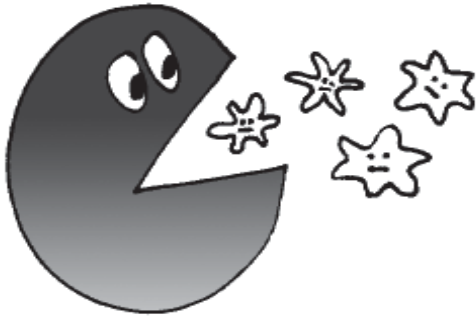
Macrophage (Big Eater)