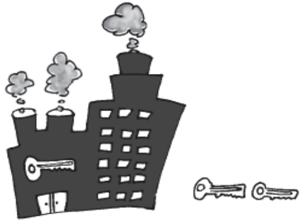
B Cells — the Antibody Factory